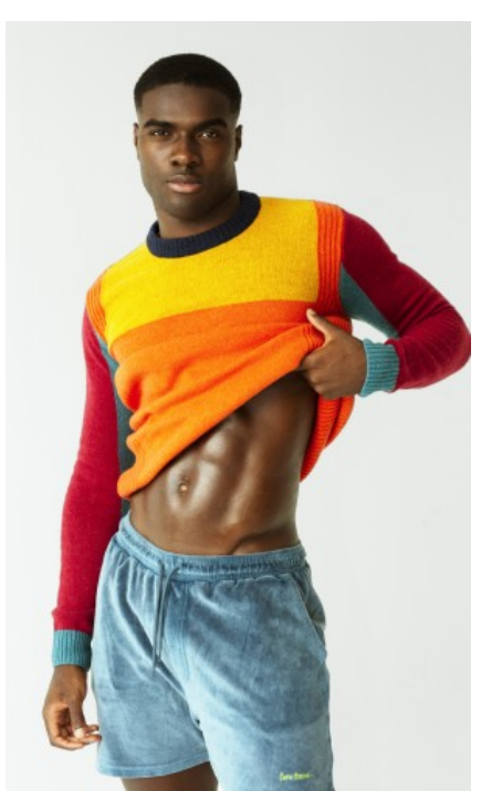
SHOES - 44 EU B/W/H · 100/76/100