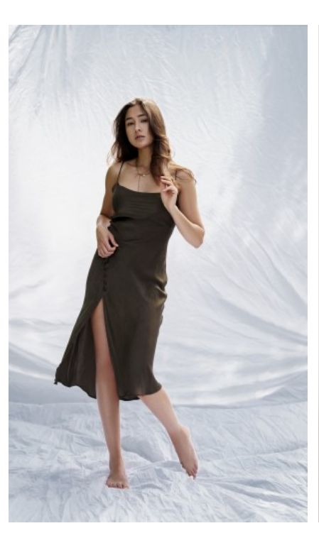
SHOES · 40 EU B/W/H · 90/68/99