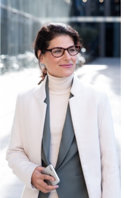
YEAR OF BIRTH · 1987 HAIR · BROWN