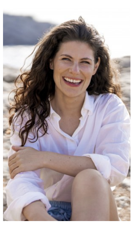
SHOES · 39 EU B/W/H · 88/95/105